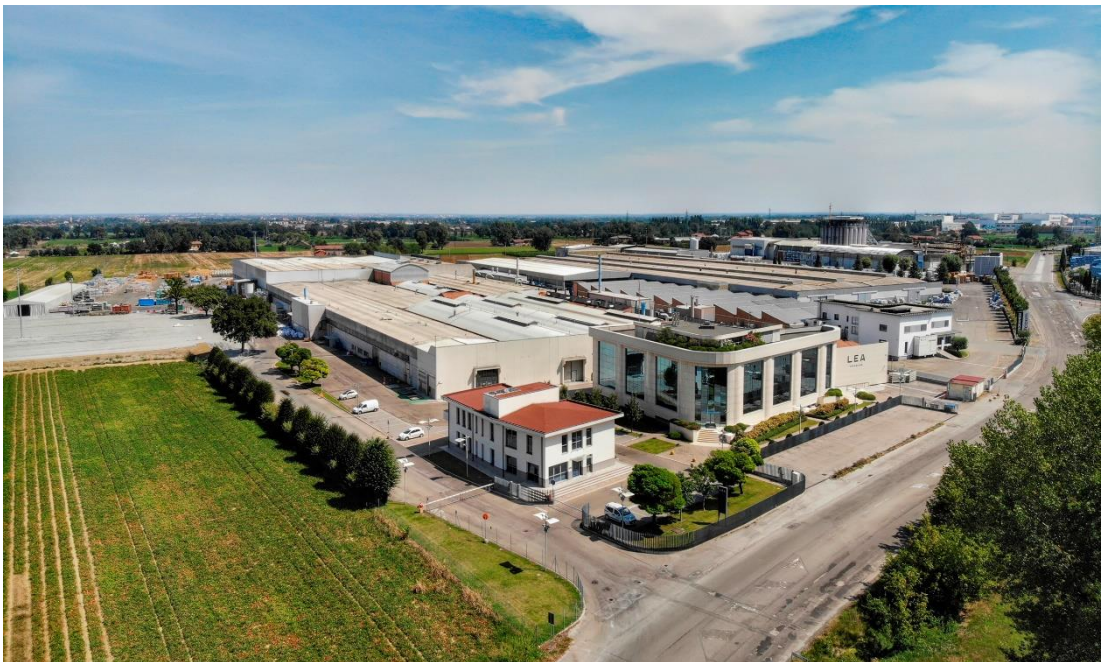
Fiorano Modenese Panariagroup Facilities