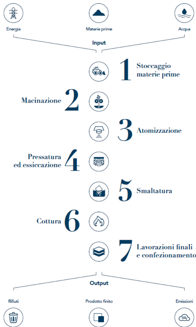
production process diagram

The pallets on which the boxes of finished product are placed are stored in a special parking area outside the factory. The product is then ready to be shipped, through to the customer. A radio frequency computer system was installed at the plant to manage the handling of finished products in the warehouse (using a new barcode label for pallet identification). This intervention allows greater control of the finished product warehouse and minimises shipping errors.