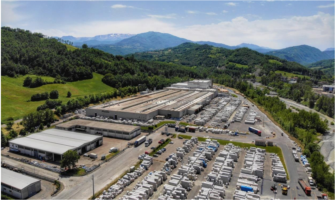
Toano Panariagroup Facilities, Fora di Cavola