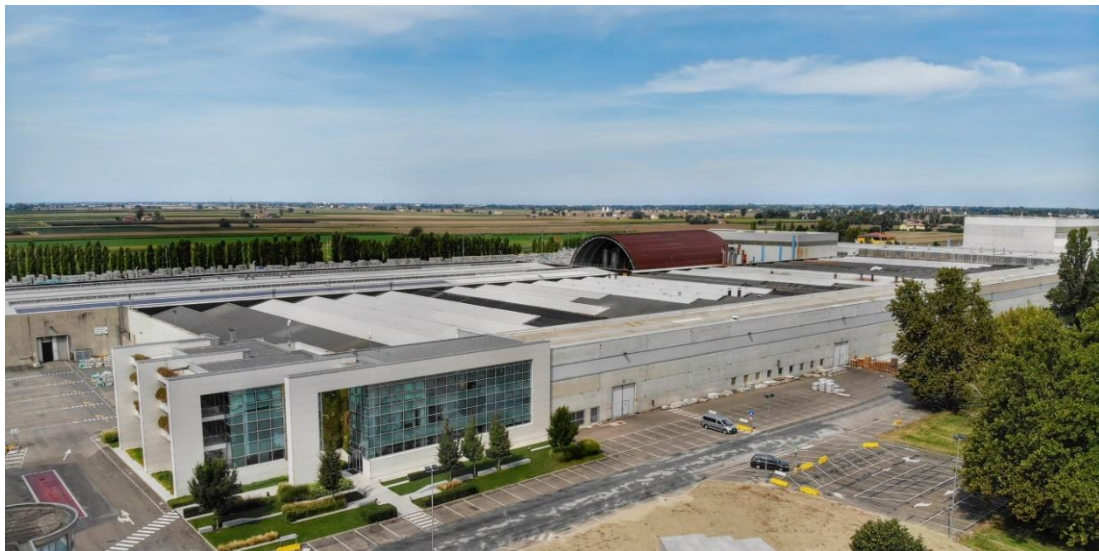
Finale Emilia Panariagroup Facilities: