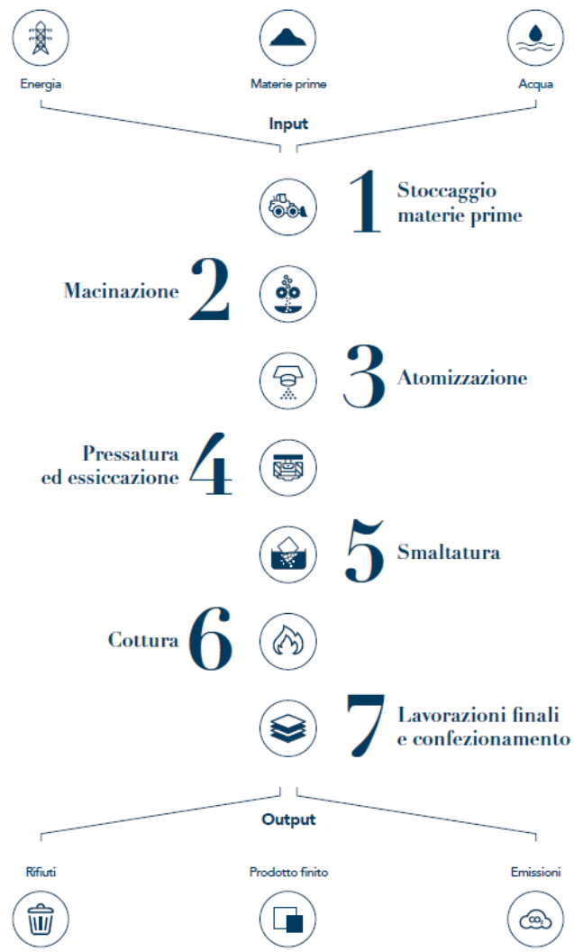
production process diagram

The pallets on which the boxes of finished product are placed are stored in a special parking area outside the factory. The product is then ready to be shipped, through to the customer. A radio frequency computer system was installed at the plant to manage the handling of finished products in the warehouse (using a new barcode label for pallet identification). This intervention allows greater control of the finished product warehouse and minimises shipping errors.